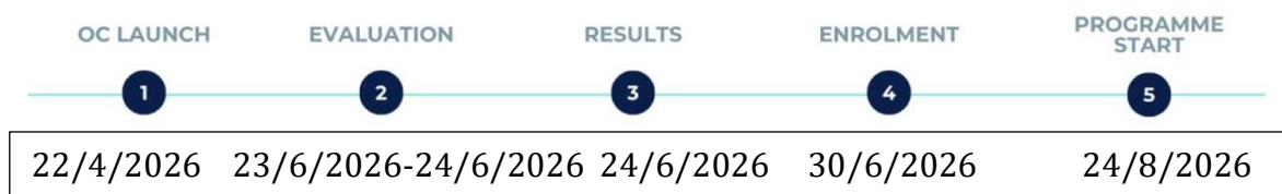
Figure 2. University of Vaasa Open Calls - Timeline

Note: While every effort will be made to adhere to these dates, they are indicative and may be subject to change due to unforeseen circumstances or operational needs. Any significant changes will be communicated via the University of Vaasa DIGI-ME project website .