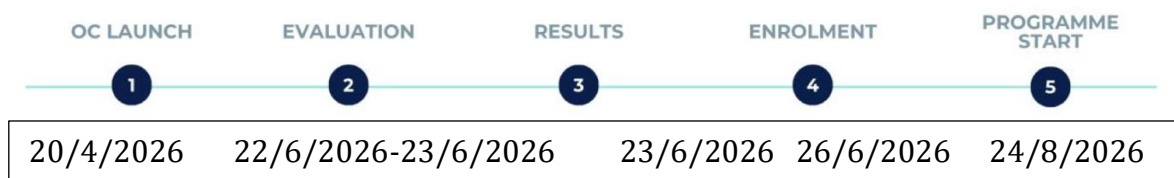
Figure 2. University of Vaasa Open Calls - Timeline

Note: While every effort will be made to adhere to these dates, they are indicative and may be subject to change due to unforeseen circumstances or operational needs. Any significant changes will be communicated via the University of Vaasa DIGI-ME project website .