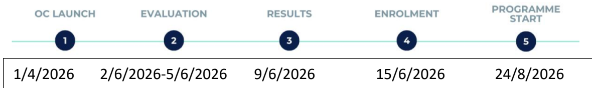
Figure 2. UNIPV Open Calls - Timeline

Note: While every effort will be made to adhere to these dates, they are indicative and may be subject to change due to unforeseen circumstances or operational needs. Any significant changes will be communicated via the MIBE website.